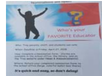
Senior send off