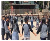
Leadership training & event promotion